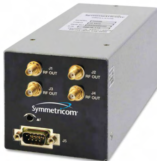
1000B Ultra-Stable Crystal Oscillator

Linearized electronic frequency control allows the use of servo loop techniques for fine frequency tuning. Linearity is better than 5% over the specified tuning range. The 1000B crystal oscillator meets the demands of a wide range of applications for military and industrial environments. The oscillator is found in precision frequency counters and synthesizers, GPS receivers, microwave multiplier chains, phase noise calibration test equipment, Stratum II telecommunications applications, radar and tactical communications systems, secure communications systems, satellite ground terminals and space flight systems.