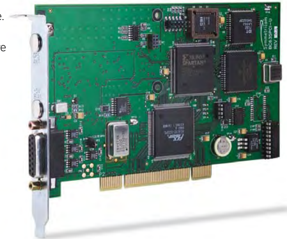
bc635PCI-U Time & Frequency Processor

A key feature of the bc635PCI-U is the ability to generate interrupts on the PCI bus at programmable rates. These interrupts can be used to synchronize applications on the host computer as well as signal specific events. The external frequency input is a unique feature allowing the internal timing of the bc635PCI-U to slave to the 10 MHz output from a Cesium or Rubidium standard. This creates an extremely stable PCI based clock for all bc635PCI-U timing functions and is superior to any disciplining technique.