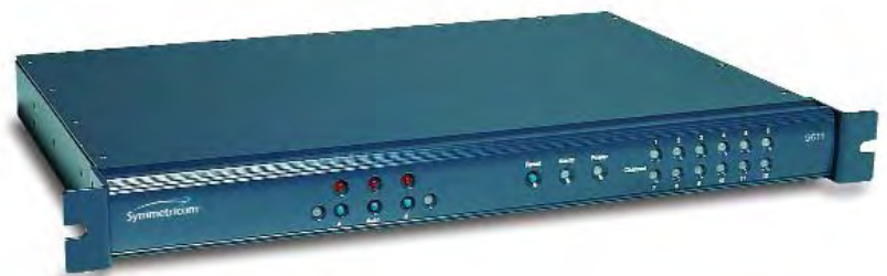
9611 Switch & Distribution Unit

This universal and highly versatile instrument is unequalled in the industry. No other low cost system offers these capabilities in a single product.