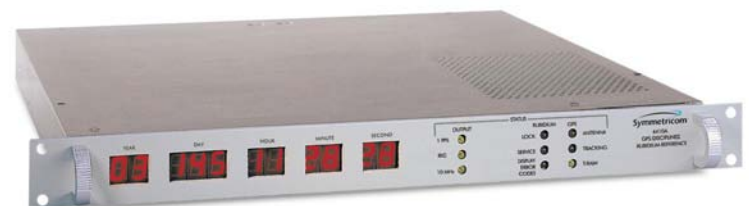
4411A GPS Disciplined Crystal Oscillator Reference

Year, day, and time-of-day are displayed on the front panel. The standard Ethernet connection simplifies integration with complex systems by allowing health and status information to be monitored remotely.